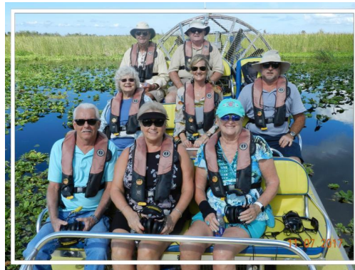
Air Boat Ride