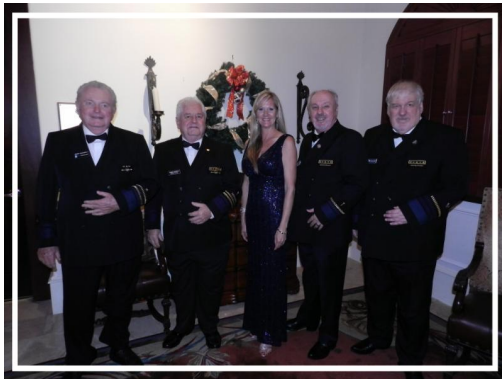
Formal Christmas Party - District 8 Guest